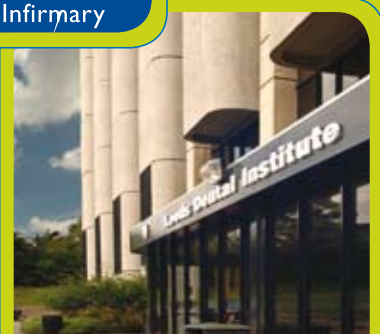
Leeds Dental Institute

Leeds Teaching Hospitals Charitable Foundation Leeds General Infirmary Great George Street LS1 3EX Tel : 0113 392 3640