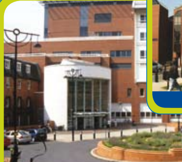
Leeds General Infirmary